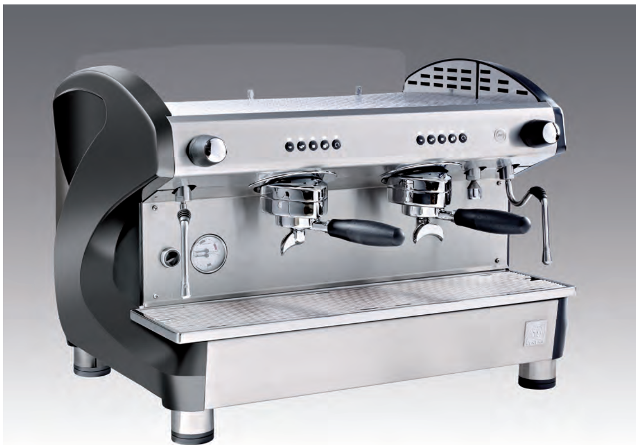
Colors: Dark grey / Piano Black / Piano White – Available in 1, 2 and 3 groups

Simply elegant, efficient without superfluous attributes, always performing and with an endless dedication, VIVA is the best marriage of manufacturing quality, operating sturdiness and ease of use.